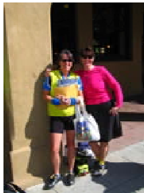
Our Fearless Leaders