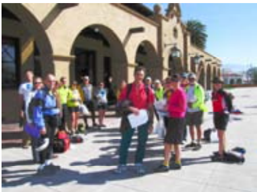
The group gathers for info